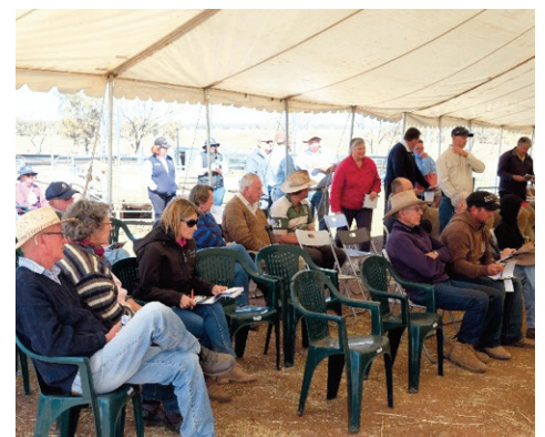
2018 RAM SALE

There are many claims from studs that are unsubstantiated by an overall low level of data collection. ►